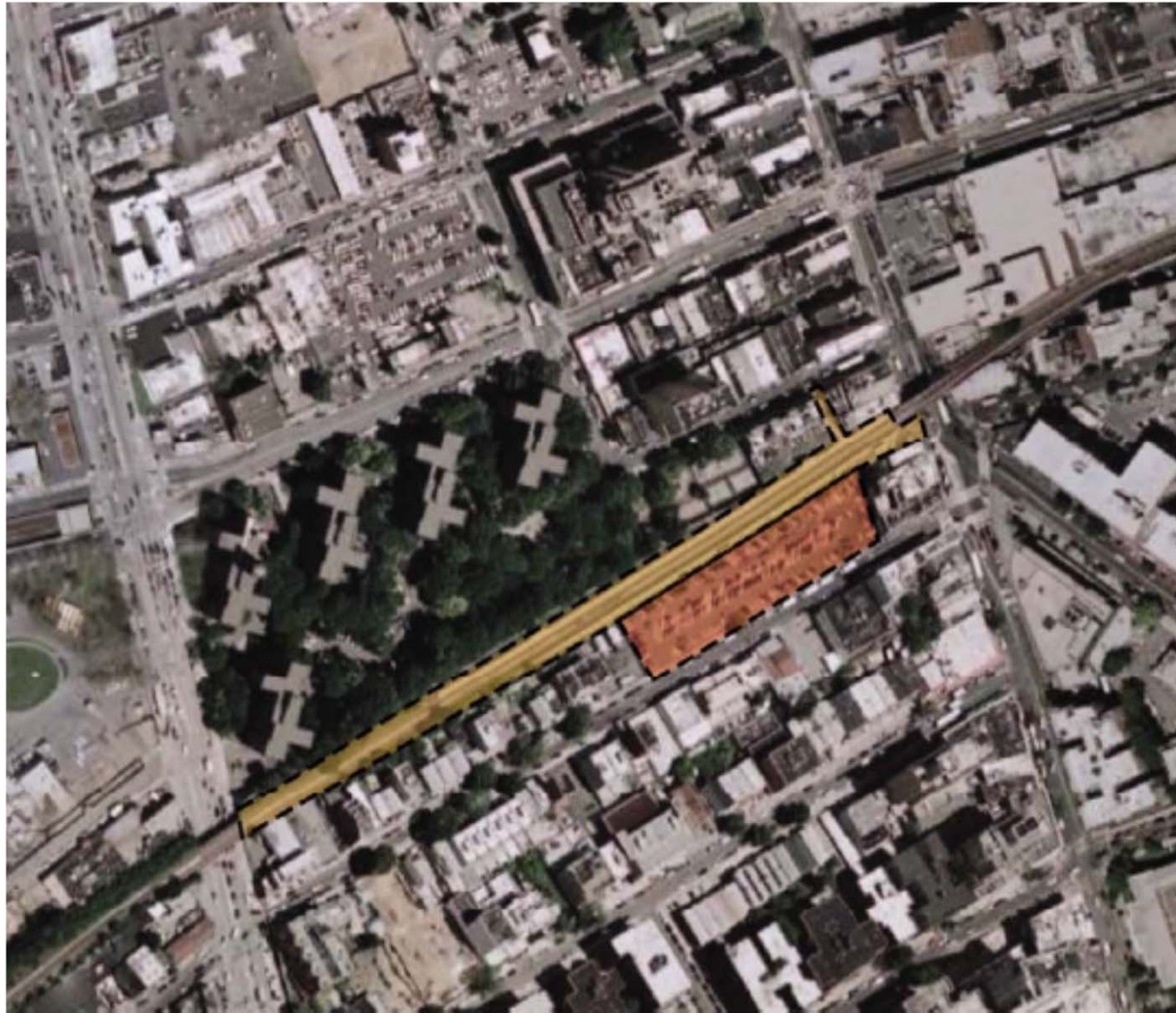
41 st Avenue between Main Street and College Point Boulevard