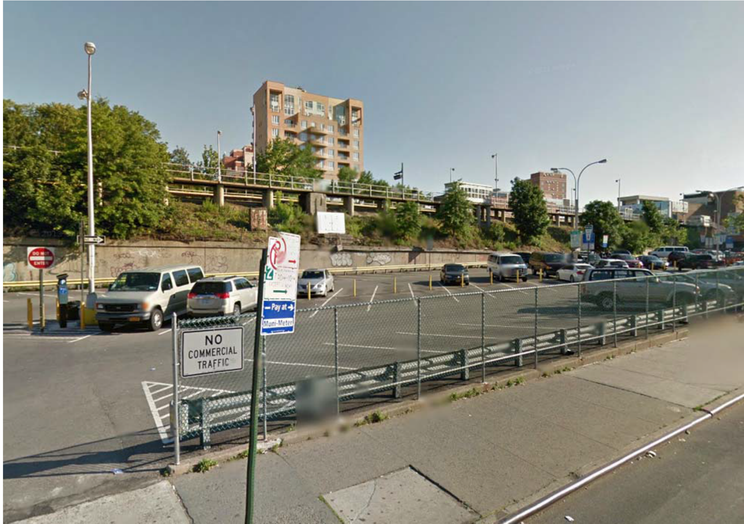
View of Municipal Parking Lot 3 (Muni Lot 3)