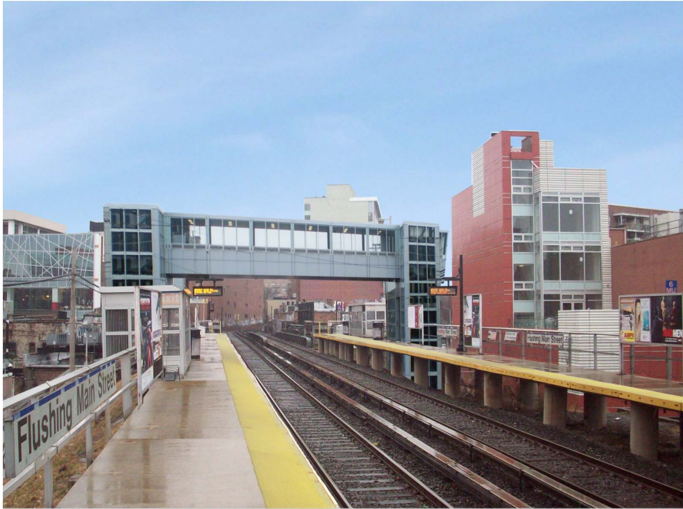
Concept Rendering of LIRR Station