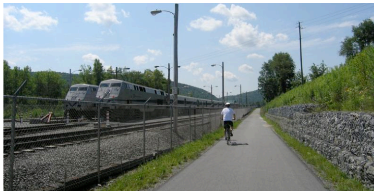
The Harlem Valley Rail Trail, Dutchess and Columbia County, NY