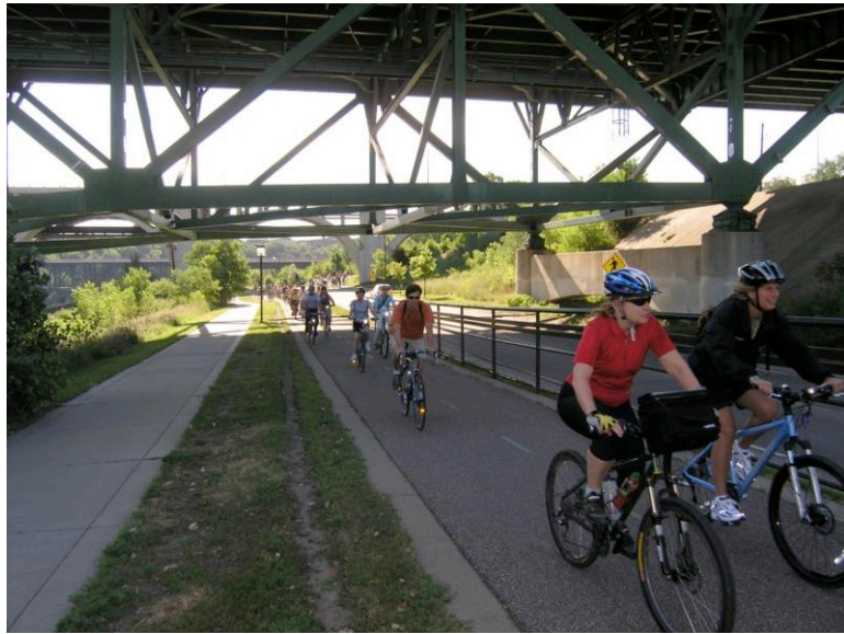
Minneapolis Loop Trail, Minneapolis, MN