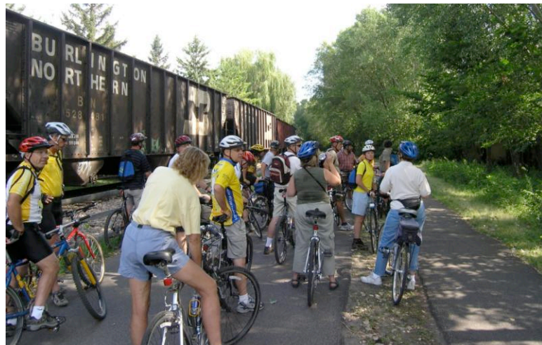
Minneapolis Loop Trail, Minneapolis, MN