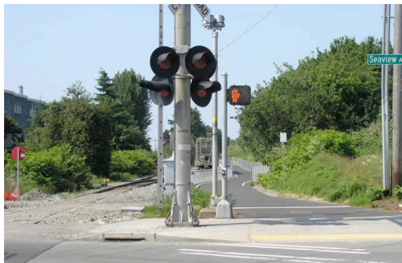
The Burke-Gilman trail, Seattle, WA