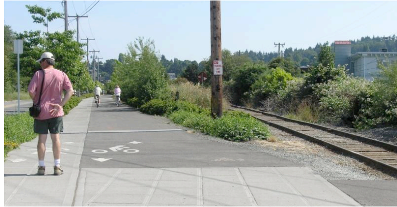
The Burke-Gilman Trail, Seattle, WA

There are several examples around the United States of rail and multi-use trail coexisting safely and without the slightest hindrance to either mode of travel, , many examples right here in the State of New York.