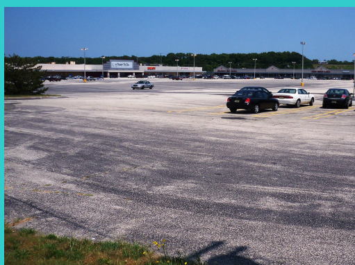
Numerous adjacent land parcels are unattractive and under-utilized