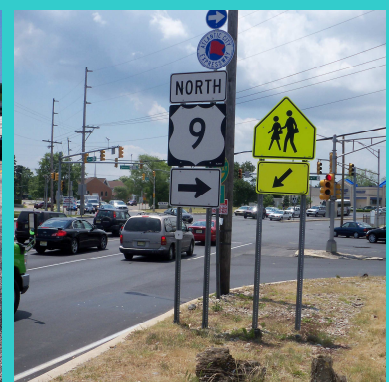
Many busy intersections lack crosswalks, and put children in danger on their way home from school